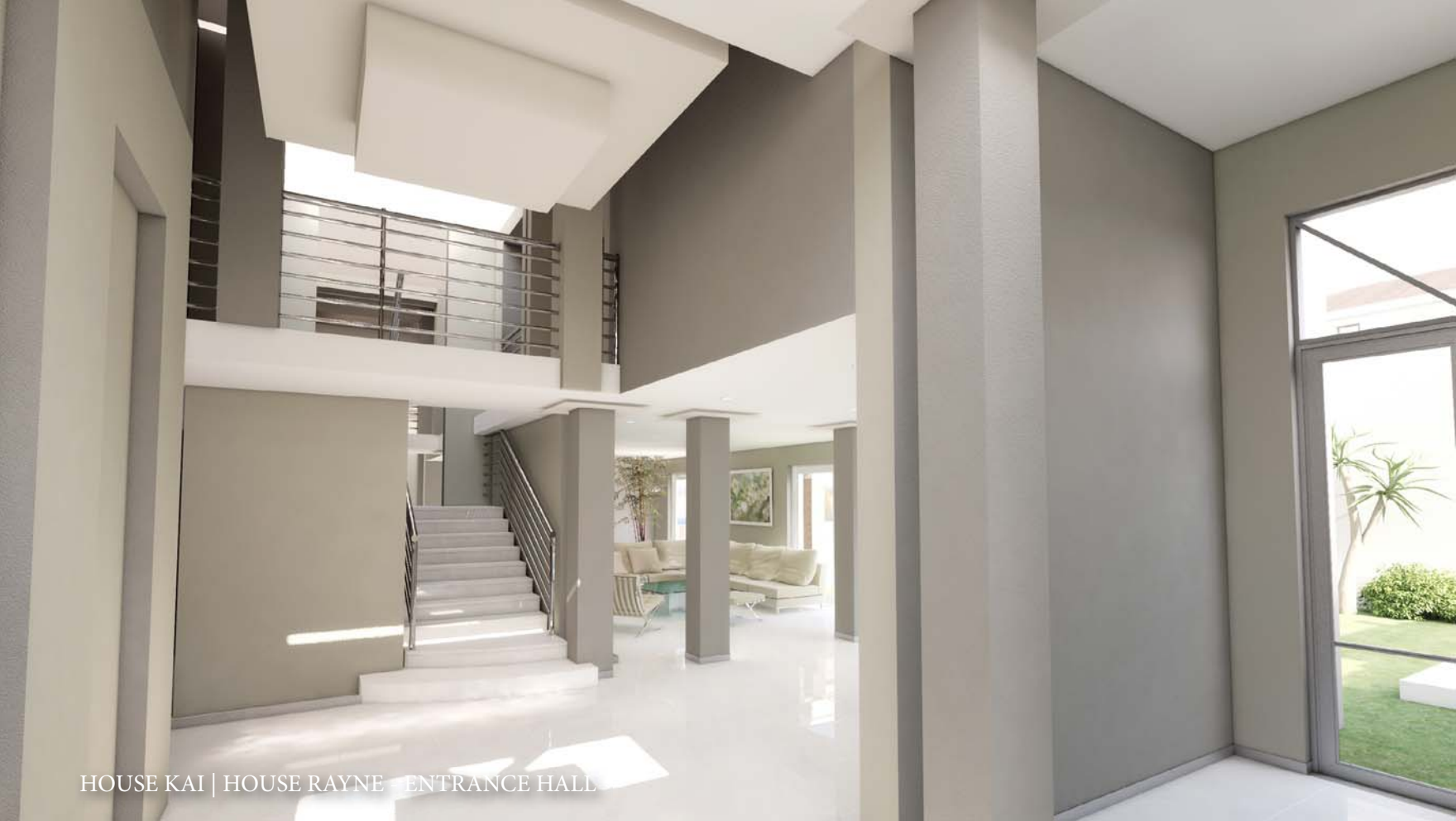
HOUSE KAI | HOUSE RAYNE | ENTRANCE HALL