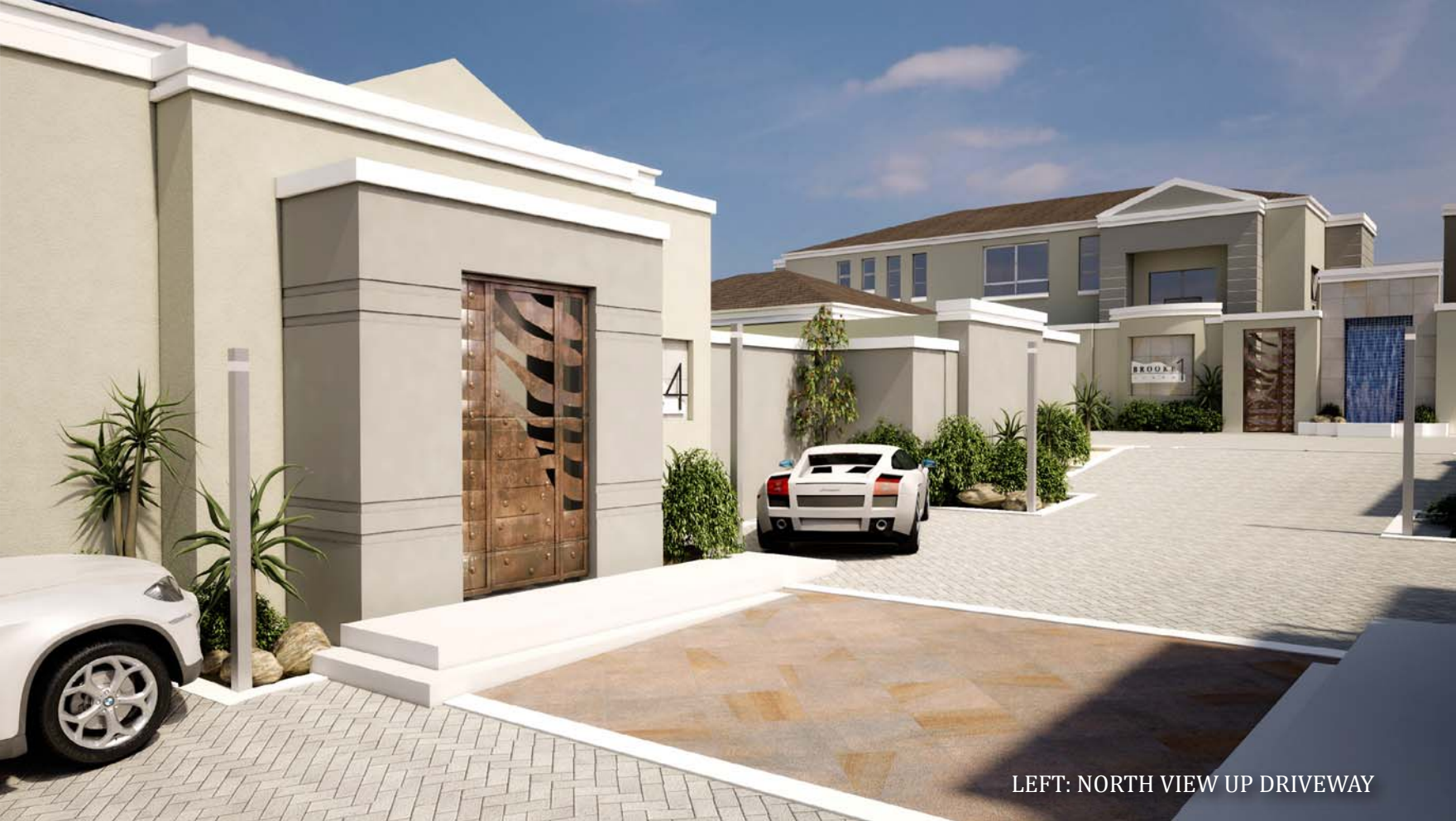
LEFT: NORTH VIEW UP DRIVEWAY